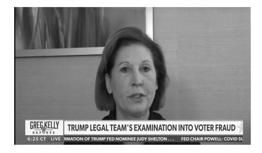
Compl. ¶ 181(k) ("Sidney Powell Trump Campaign Lawyer"):